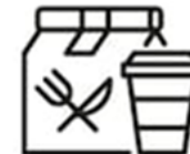
FREE FRUIT & DRINK

At Frontier Developments we recognise the outstanding contribution our people make to our success and reward them accordingly. The company provides a flexible benefits platform, FrontierFlex, which enables you to access your core benefits, along with a range of additional voluntary benefits you can select from. You can also take advantage of various benefits through our salary sacrifice scheme, providing a tax efficient way of paying into your pension and purchasing other voluntary benefits, with the cost of the benefits taken from your gross salary. This brochure explains the suite of company and voluntary financial and non-financial benefits that Frontier Developments provides.